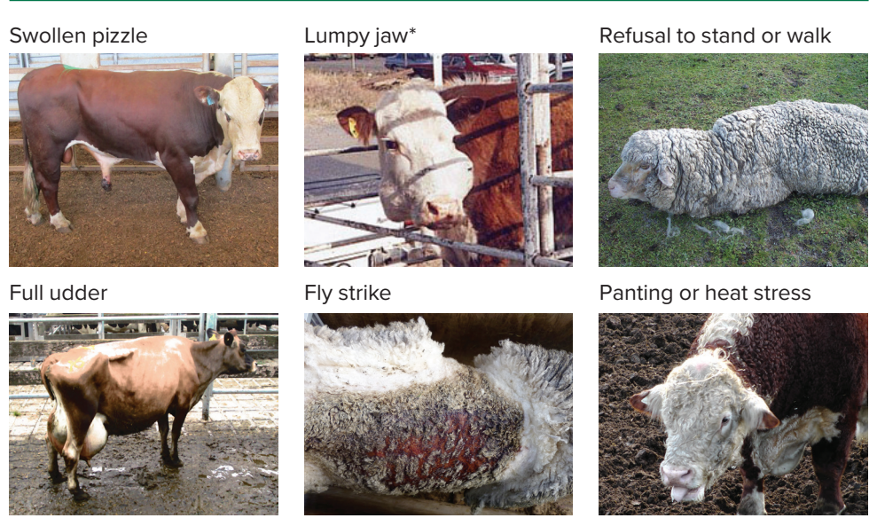
Note: Panting may indicate the animal is in pain. Animals in heavy lactation with full udders should not be transported.